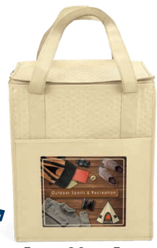
THERM-O SUPER TOTE

Front pocket offers a wider imprint area!